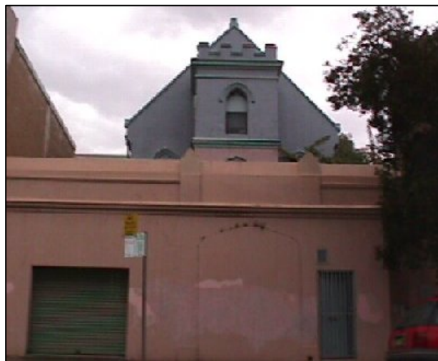
Remains of the old St Michael's Melkite Church in Wellington Street, Redfern. The deconsecrated church building is now part of a housing complex.