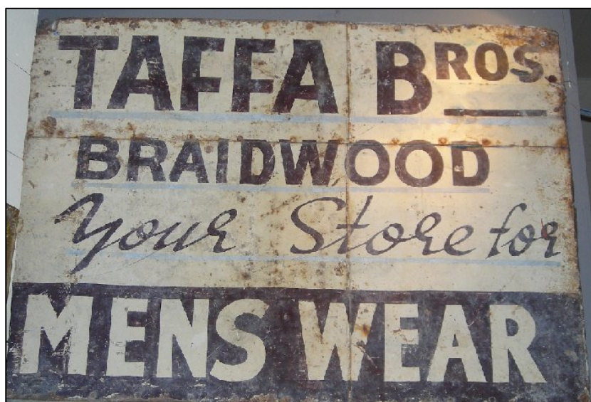
Sign from Taffa Brothers store at 139 Wallace Street, Braidwood. The building still stands in the main street. The sign is on display in the Braidwood Museum.

Although Sydney was always the major settlement focus for Syrian/Lebanese in NSW, the development of a network of Lebanese operating businesses throughout country NSW led to the establishment of other important settlements in and around the large rural urban centres. By the late 19 th century and early part of the 20 th century, a number of small Lebanese communities had formed in and around the southern towns of Goulburn, Crookwell, Cootamundra, Tumut, Cooma and Braidwood. 148