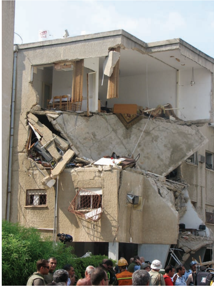
A rocket hit this apartment building in the Bat Galim neighborhood of Haifa on July 17, 2006, wounding six residents.

Haifa Police Chief Meri-Esh believes Hezbollah was aiming mostly at targets in the port area and that the relatively few rockets that reached the upper city were “over-shots.” The problem is that between the port area and the more affluent upper city neighborhoods on the hill are the lower residential neighborhoods, some densely populated. Thus, if Hezbollah was in fact trying to hit objects on the waterfront, its inaccurate rockets, flying a distance of thirty kilometers, stood a good chance of striking—and did indeed strike—residential and shopping neighborhoods just beyond.