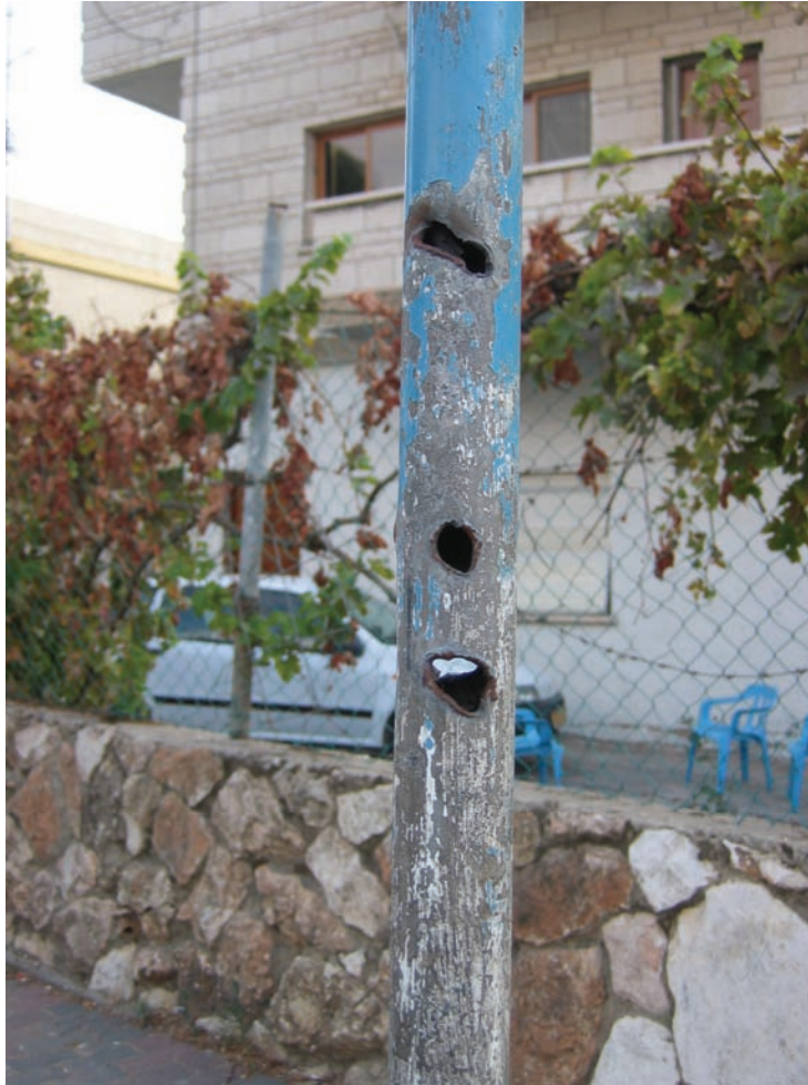
A pole on a sidewalk in Majdal Krum that was penetrated by steel spheres and shrapnel from a rocket that landed on the street nearby on August 4, 2006, killing two men.

Visiting the site of the attack on September 30, Human Rights Watch saw a filled-over hole in the street that Hussein said the rocket had caused, as well as shrapnel damage on nearby poles and street signs.