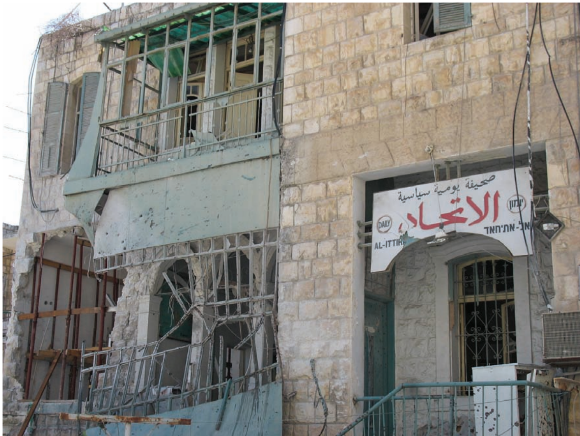
A building in the Wadi Nisnas neighborhood of Haifa, housing the archives of al-Ittihad newspaper, after a rocket struck on August 6, 2006, killing two elderly persons next door.

If Hezbollah had indeed been targeting military or industrial objects in Haifa some of the time, it expressed no regret for the civilian casualties it was inflicting until its rockets first hit the majority-Arab neighborhood of Wadi Nisnas on August 6, killing two residents and seriously wounding a third. It was then that Hezbollah secretary-general Nasrallah went on television to urge Arab residents to leave the city. (See chapter below on “Hezbollah’s Justifications for Attacks on Civilian Areas.”)