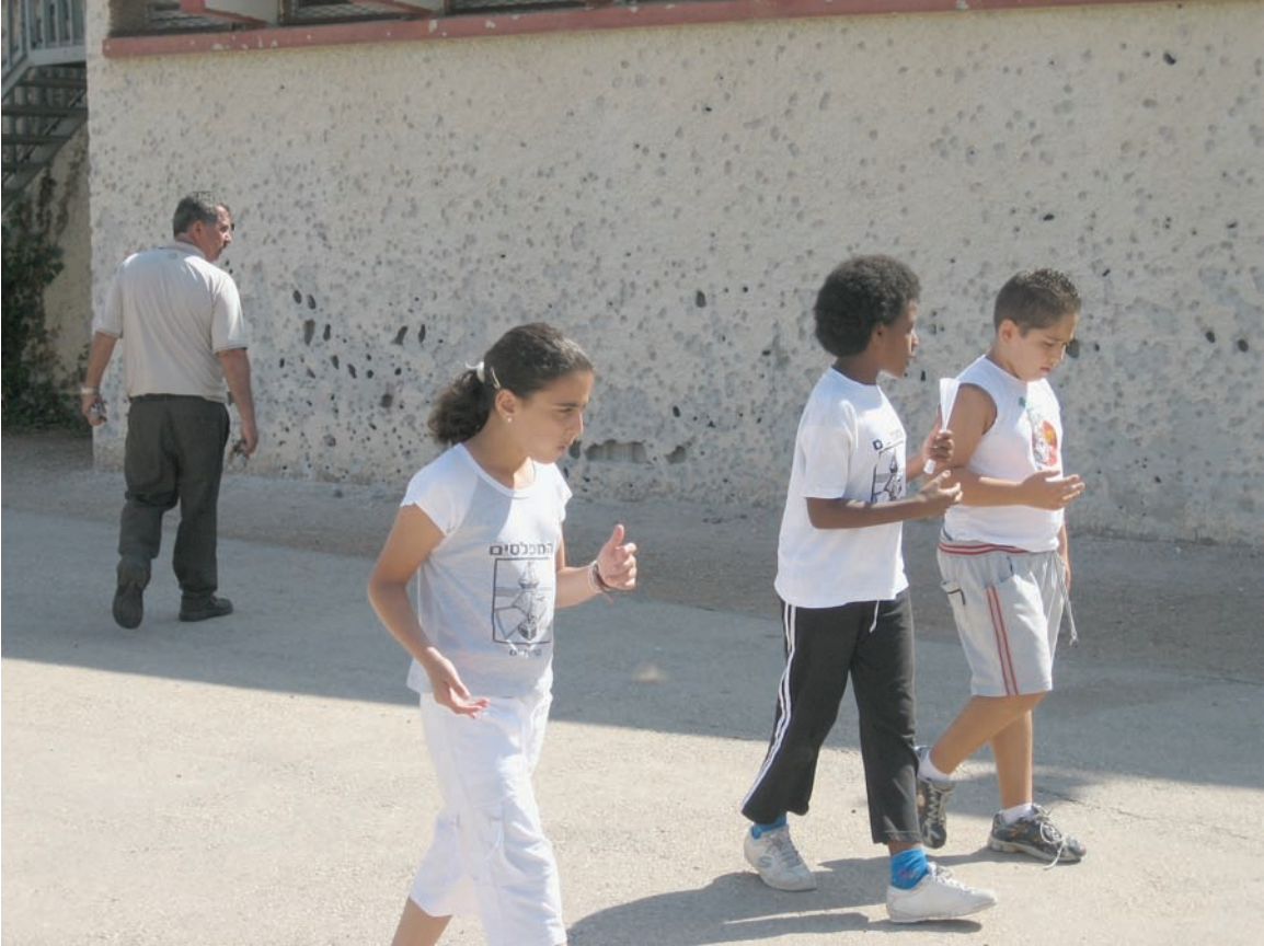
A wall of the elementary school “HaMiflasim” in Kiryat Yam, damaged by steel spheres from a rocket that hit an adjacent classroom on August 13, 2006.

Hezbollah provided no specific information about its attacks on Kiryat Yam or its intended targets there; it has not replied to Human Rights Watch requests for information about these attacks.