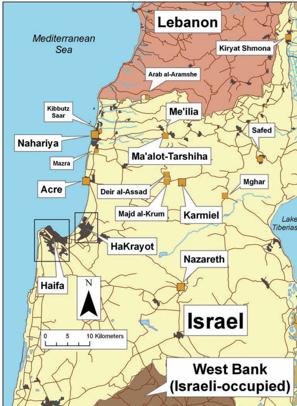
Northern Israel, showing locations struck by Hezbollah rockets that are described in this report.